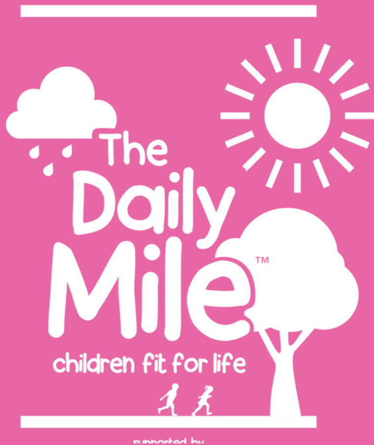
Logo — a "freebie" to start the achievement banner