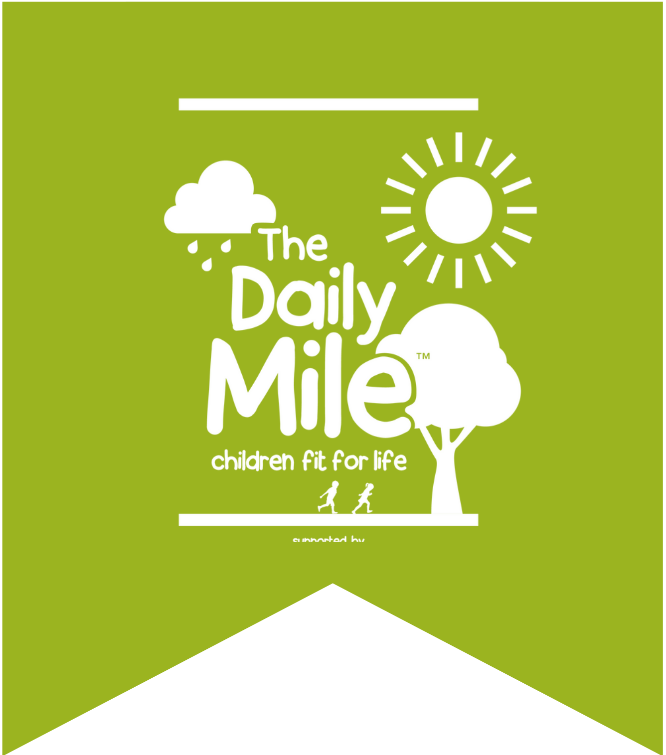
Logo — a "freebie" to end the achievement banner